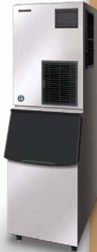
> FM-600AKE (With Hoshizaki Storage Bin - B-301SA )

daily ice production capacity of up to 530kg