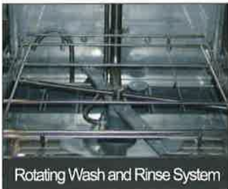
Rotating Wash and Rinse System