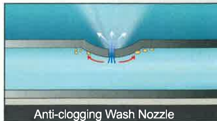
Anti-clogging Wash Nozzle