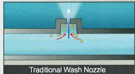
Traditional Wash Nozzle