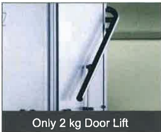
Only 2 kg Door Lift